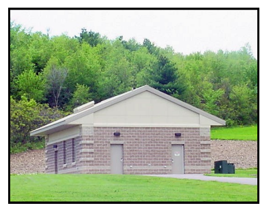
Well # 8 Located by Reedsburg Area High School

RADIOACTIVE CONTAMINANTS can be naturally-occurring or be the result of oil and gas production and mining activities.